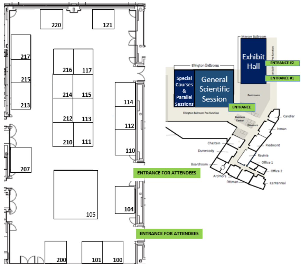
EXHIBIT HALL FLOOR PLAN MERCER BALLROOM Loews Hotel | Atlanta, GA

Please contact your CNS Industry Relations Representative or email corporatedevelopment@cns.org for the most up-to-date Floor Plan