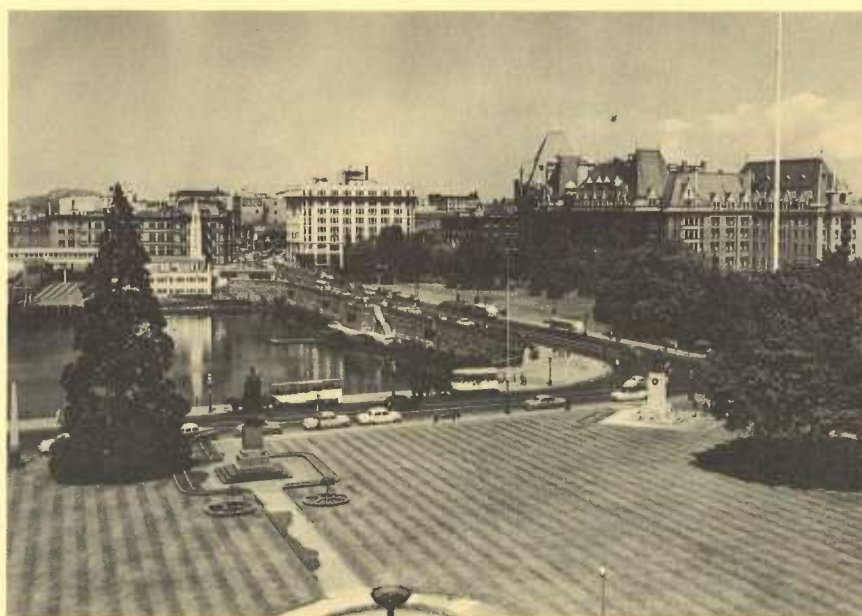
Empress Hotel Site of Post-Convention Scientific Session