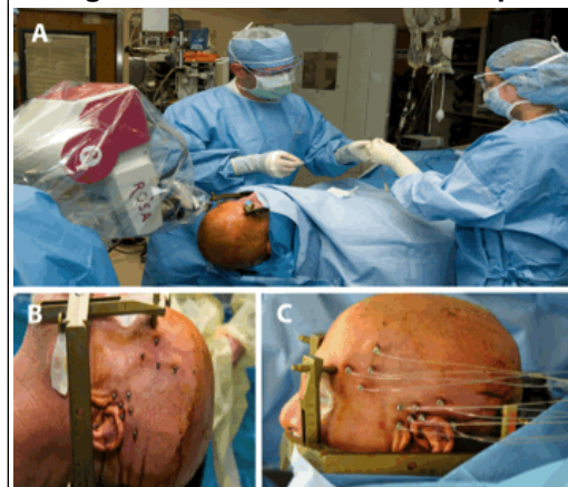
Figure 1. Robotic SEEG technique

A: Operating room “set up” during left side SEEG robotic implantation, with surgeon and scrub nurse positioned on each side of the patient, and the robot device placed in the middle, at the vertex. B: Intraoperative aspect of left side frontal-temporal SEEG implantation with the guiding bolts final position. C: Left side frontal-temporal SEEG implantation after the depth electrodes implantations. Final aspect.