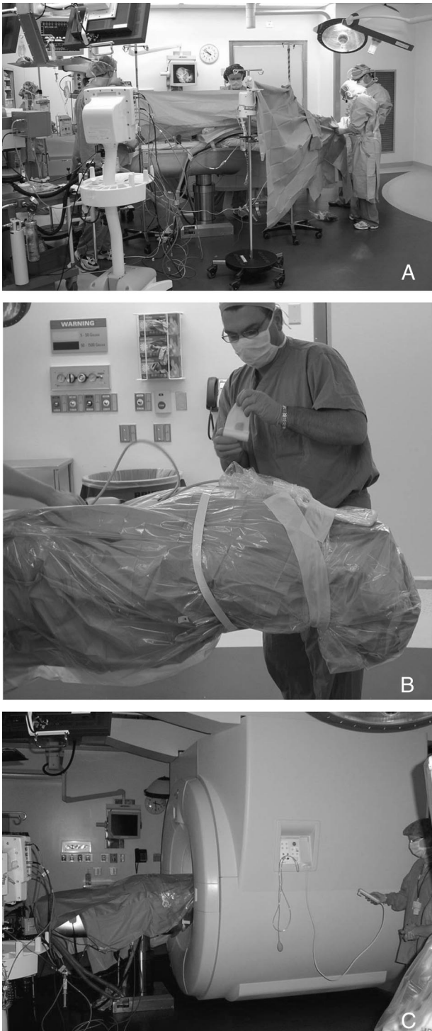
FIGURE 4.1. The intraoperative MRI scanner at the Children's Hospital in Boston is an IMRIS ceiling-mounted system. There is a dedicated operating room, which is a standard large operating room (A) with the MRI scanner stored in a garage behind closed doors. For imaging, the patient and the operating table are covered in sterile material (B) and the scanner slides from the garage along overhead tracks on the ceiling over the operating table (C).

MRI scan findings are closely correlated with the true extent of the pathological process. The surgical procedure itself will create artifact that, in a nonenhancing tumor that has a high signal on T2-weighted and fluid-attenuated inversion recovery MRI scans, may be mistaken for residual lesional tissue. We know that more technological advances, in particular, the development of a user-friendly system of intraoperative re-registration for frameless stereotactic image guidance, will make the intraoperative MRI scan an even more beneficial surgical adjunct.