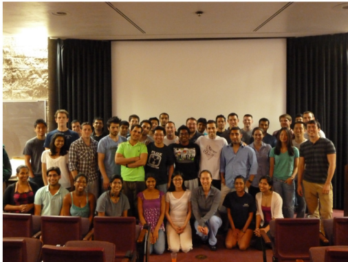
Attendees at a neuroanatomy review session sponsored by the Neurosurgery Interest Group

Reasons for participating have included increasing knowledge of neurosurgical diseases, gaining exposure to a surgical field, resident shadowing, and research opportunities.