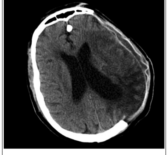
Non Contrast axial CT head: post operative scan after craiectomy with sliastic sheath placement