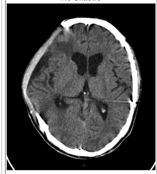
Non Contrast axial CT head: post operative scan after craniectomy without silastic