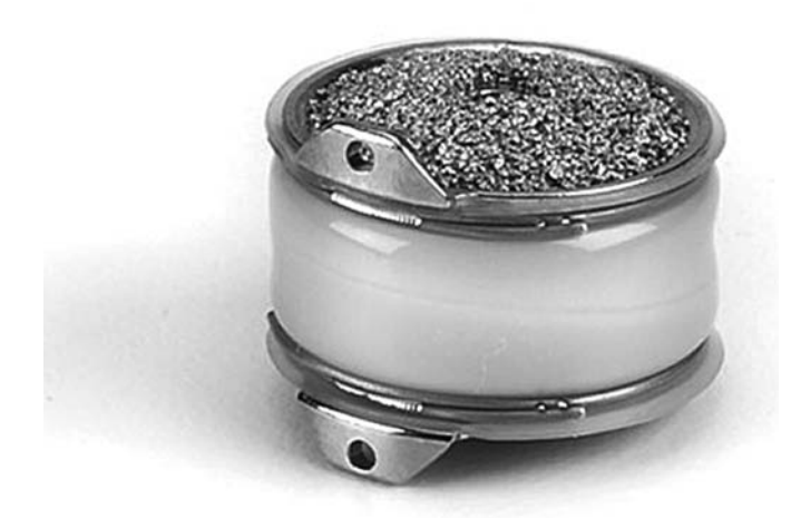
FIGURE 21.3 Bryan Cervical Disc