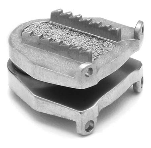
FIGURE 21.2 Prestige LP

The FDA IDE study design has the same inclusion and exclusion criteria as the Prestige ST study. Patients are not randomized, and all enrolled receive an experimental device. The clinical, radiographic, and patient outcomes will be statistically compared with the data collected in the Prestige ST study.