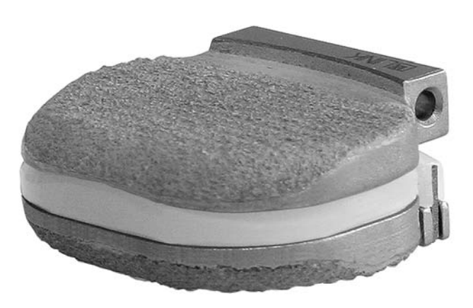
FIGURE 21.5 PCM