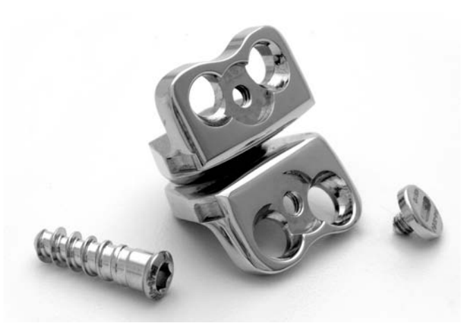
FIGURE 21.1 Prestige ST

The Prestige LP is manufactured from a unique titanium ceramic composite material that is highly durable and image-friendly on computed tomographic and magnetic resonance imaging scans ( Fig. 21.2 ). The ball-and-trough articulation is identical to that of the Prestige ST. Initial fixation is achieved via four rails, two on each component, which engage the vertebral bodies. A porous titanium plasma-spray coating on the endplate surface facilitates bone ingrowth and long-term fixation.