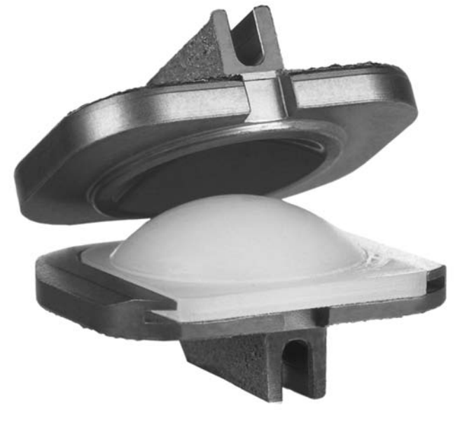
FIGURE 21.4 ProDisc-C Cervical Disc

The PCM is currently the subject of an FDA-approved IDE study of its use in patients with single-level disc degeneration or herniation and radiculopathy or myelopathy. Patients will be followed for 2 years, and both clinical and radiographic outcome criteria will be reviewed and compared with a randomized control group of patients treated with fusion using allograft bone and a plate. Notably, the use of the implant adjacent to previous single-level fusions is possible in the PCM IDE study, an application many anticipate to be most promising in the future use of cervical arthroplasty implants.