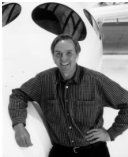
Innovation in Design, “Engineer of the Year” by Design News, the British Gold Medal for Aeronautics and the 2000 Charles A. Lindbergh Award.

For his accomplishments, Mr. Rutan has received many awards, including the Presidential Citizen’s Medal, a Collier Trophy, the Chrysler Award for